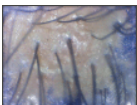
Figure 1 Pre-treatment trichoscan image

Between August 2013 and November 2013, all patients suffering from androgenic alopecia and on topical minoxidil and finasteride for at least 6 months without much improvement were considered for PRP therapy. Written informed consent was obtained. All included patients were tested by ELISA for HIV, HBS Ag and platelet count. Exclusion criteria were haematological disorders, thyroid dysfunction, malnutrition and other dermatological disorders contributing to hair loss. A 1 cm × 1 cm square area was marked over right parietal area in mid-pupillary line, 10 cm proximal to right eyebrow in each patient. Baseline follicular units were manually counted with the help of trichoscan in this area by dividing into four small quadrants [Figures 1 and 2].